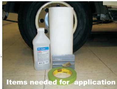
Items needed for application

Wash and dry the unit thoroughly. Using paper towel, (not shop towels) wipe the complete surface down using isopropyl alcohol. The cleaner the surface the more successful the application will be. Taking your time on surface prep will insure better adhesion to the golf car.